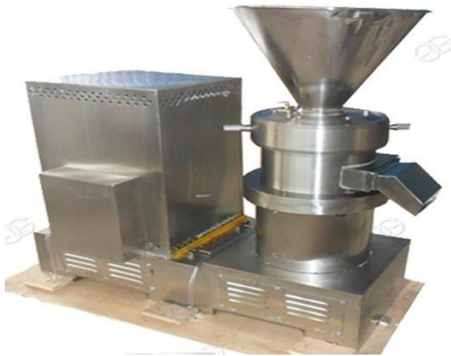
Cocoa liquor machine

1) Cocoa mass or liquor- The dried beans are cleaned and roasted uniformly to get the desired aroma. The roasted beans are broken and winnowed to get good nibs(cotyledons). When these nibs are ground using a boll mill crusher or grinding machine, cocoa liquor or cocoa mass is obtained. There are two types of cocoa mass-natural mass and alkaline mass.