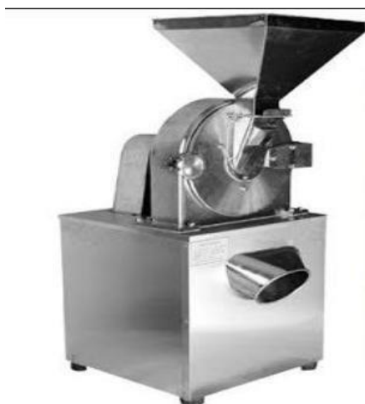
Cocoa grinding machine

3) Cocoa powder- The solid blocks of compressed cocoa remaining after the extraction of cocoa butter are pulverised into a fine powder called cocoa powder-high fat powder containing 20-25% of fat which is used in drinks and low fat powder containing 10-13% of fat and is used in cakes, biscuits, ice-creams and other chocolate flavoured products.